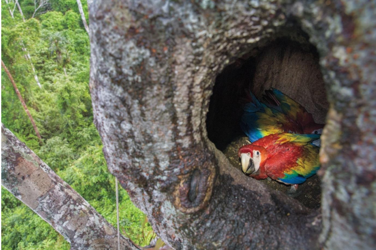
Photo: Two Scarlet Macaws chicks sit in their nest in the cavity of a quamwood tree in Belize's Chiquibul Forest.

Wildlife poaching constitutes a destruction of the general environment and is driven by demand for exotic animals or animal parts. The global annual value of the wildlife trade is estimated between $5 billion to $23 billion. 27