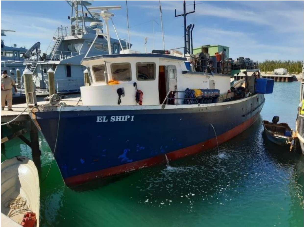
Photo: A vessel from the Dominican Republic was interdicted in the Bahamas for illegal fishing in a joint operation between the Royal Bahamas Defence Force (RBDF) and U.S. Coast Guard in September 2020. Source: RBDF.

It is estimated that global, annual illegal and unreported marine fishing generates between $15.5 billion to $36 billion in illicit profits. These figures represent 14 to 33 percent of global marine capture value. 31 Illegal fishing is an especially important issue for the Caribbean since it is largely a